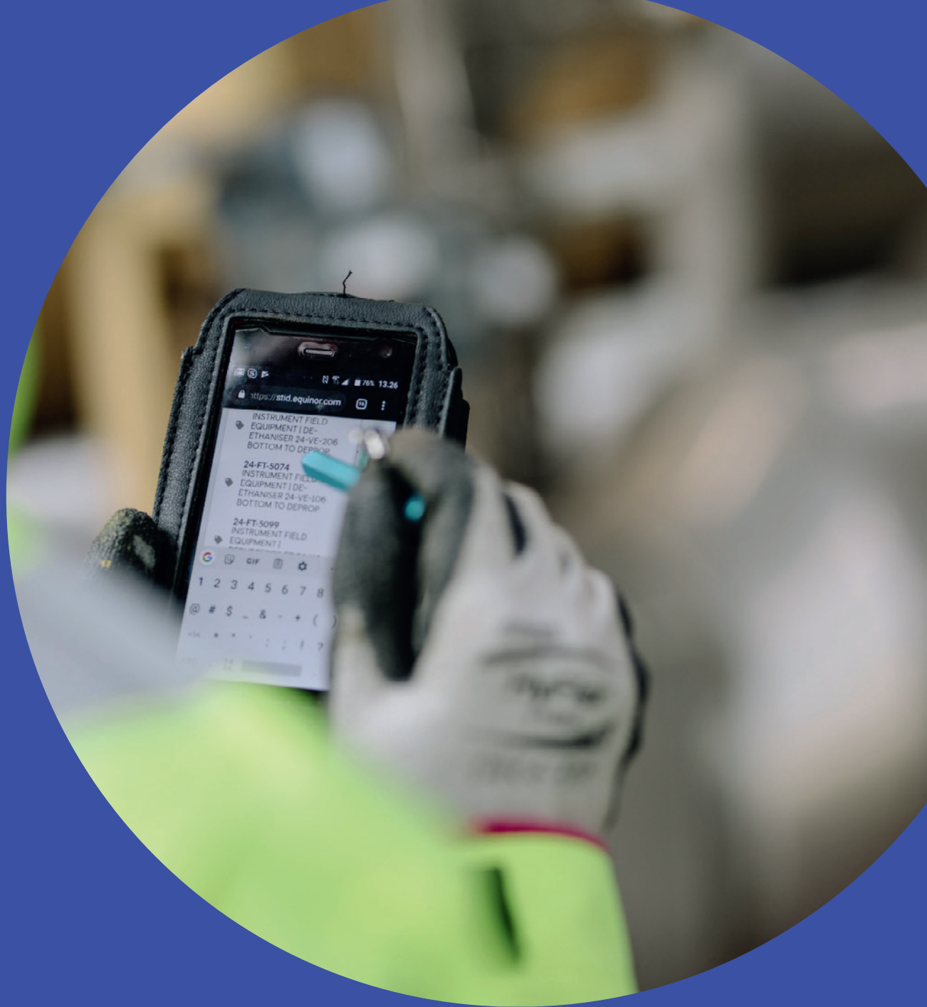
Digital field worker.