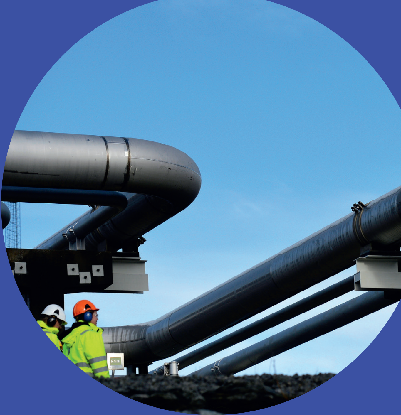
Kårstø.