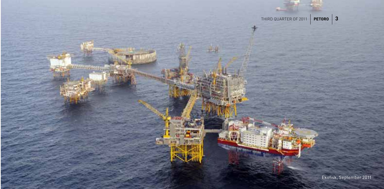
Ekofisk, September 2011

Petro participates with a 30 per cent holding in the substantial Aldous Major South oil discovery in the North Sea. Estimates suggest that, together with the nearby Avaldsnes find, this could be the third largest oil field on the NCS after Statfjord and Ekofisk.